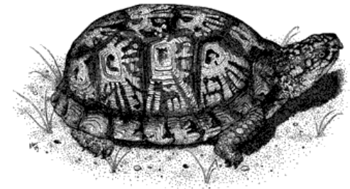
Eastern Box Turtle

Membership in WRNC runs from January 1 to December 31 and is renewed annually. It includes the following: